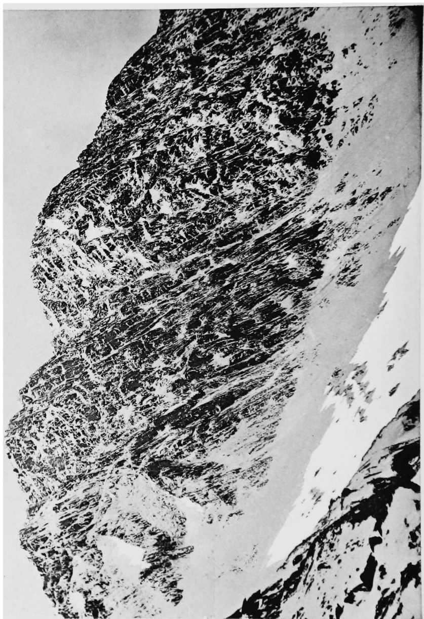
The north face of Lliwedd.